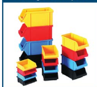
Storage & Transport